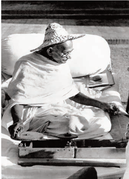
Gandhi spinning Noakhali